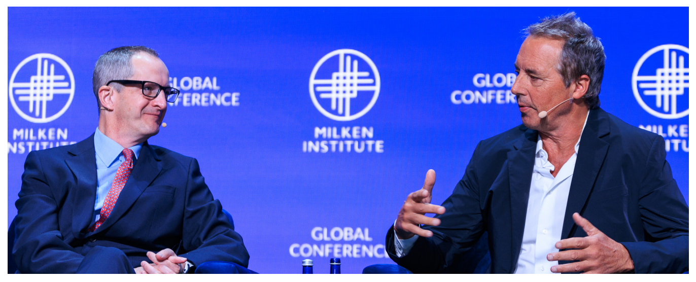
James Bethell (left) and Dan Buettner spoke on "Longevity Lab: Can You Live to 100?" at the Milken Institute 2024 Global Conference in Los Angeles.

choice the easy choice." Enriched environments offer valuable insights into designing urban spaces to improve brain health. These environments support individuals' physical, mental, social, and cognitive needs, promoting neurogenesis and enhancing brain health. Cities embracing characteristics of environmental enrichment can foster brain health and longevity through initiatives such as providing affordable housing with ample light and social spaces, colocating living and learning areas, prioritizing multimodal mobility, and facilitating access to nature and healthy food options.