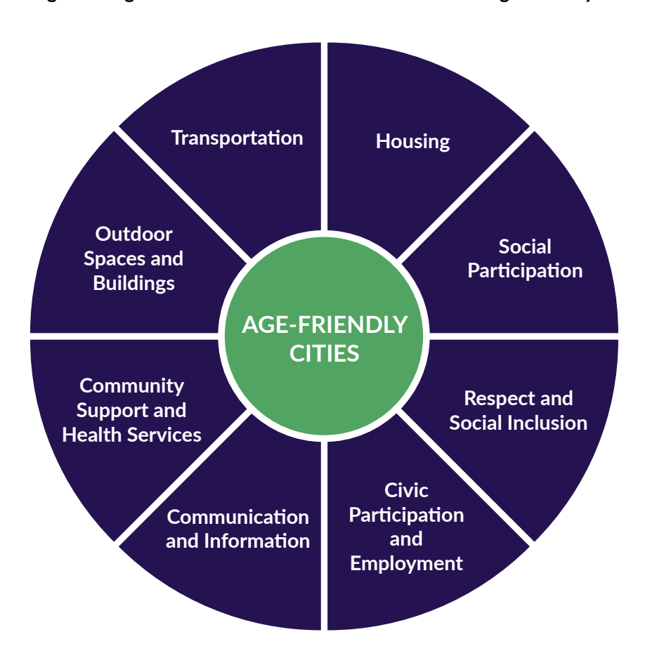
Figure 3: Eight Interconnected Domains of the WHO's Age-Friendly Cities Framework

The World Health Organization (WHO) outlined a framework for the Urban Physical Environment in 2007, highlighting eight factors that set the foundation for how cities can support longevity, including transportation, housing, social participation, respect and inclusion, civic participation and involvement, communication and information, community support, and outdoor spaces and buildings.<sup>26</sup>