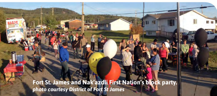
Fort St. James and Nak'azdli First Nation's block party.