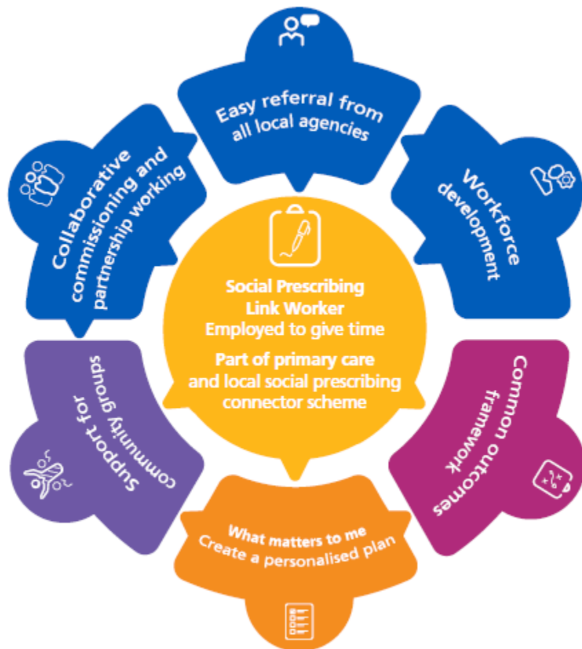
Figure 2: Model for social prescribing

For an implementation checklist for local partners and commissioners for these key elements, see Annex C. The rest of this section sets out more detail of what each of these features requires in practice.